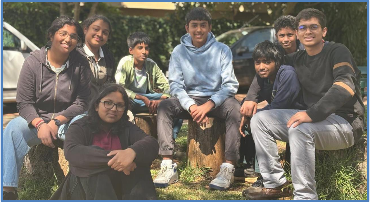
The talented students of Grade 8 who organized Jamboree this year